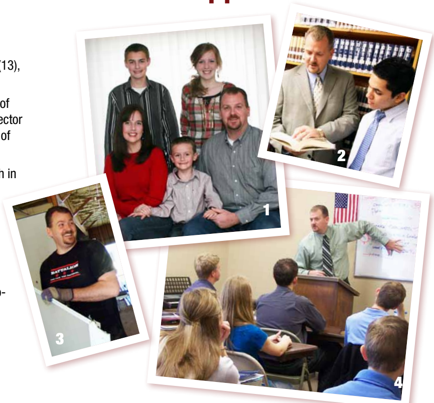
1. The Caupp family. 2. Explaining a theological concept. 3. Helping with the new IBC building. 4. At home in the classroom.

Weird Fact: I have actually gone cow tipping!