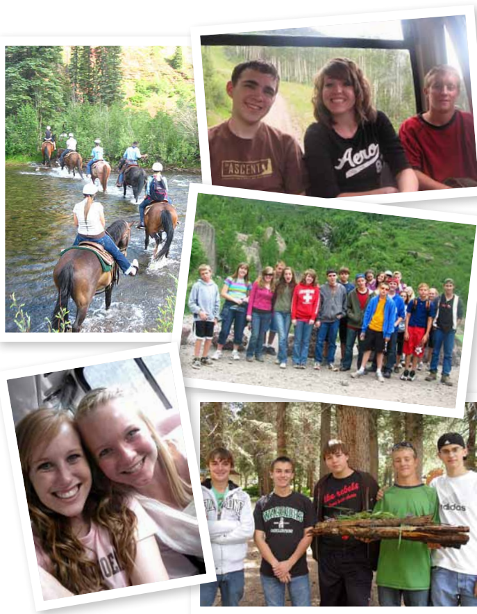
See more photos and read more about this and other events on our website.

Last week 37 of Tri-City's teens traveled to Circle K Ranch in Colorado for Teen Camp. Many important decisions were made. Seven teens turned to Christ for salvation, and five received assurance of their salvation. One boy was so excited about getting saved that he wanted to be baptized where he'd gotten saved. According to teens who have been attending Tri-City's Teen Camp for several years, this was the best camp they'd ever attended.