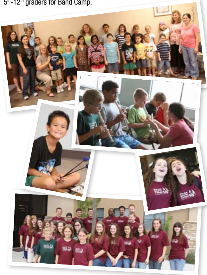
See more photos and read more about this and other events on our website.

Last week nearly forty young people descended on Tri-City's campus for International Baptist College's first Fine Arts Summer Camps: Discover Music! Camp for Kids for 1 st -6 th graders, and Music Camp for 7 th -12 th graders. This week IBC expects almost 50 5 th -12 th graders for Band Camp.