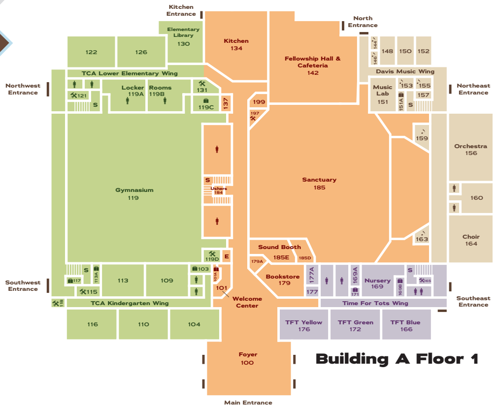
Building A Floor 1