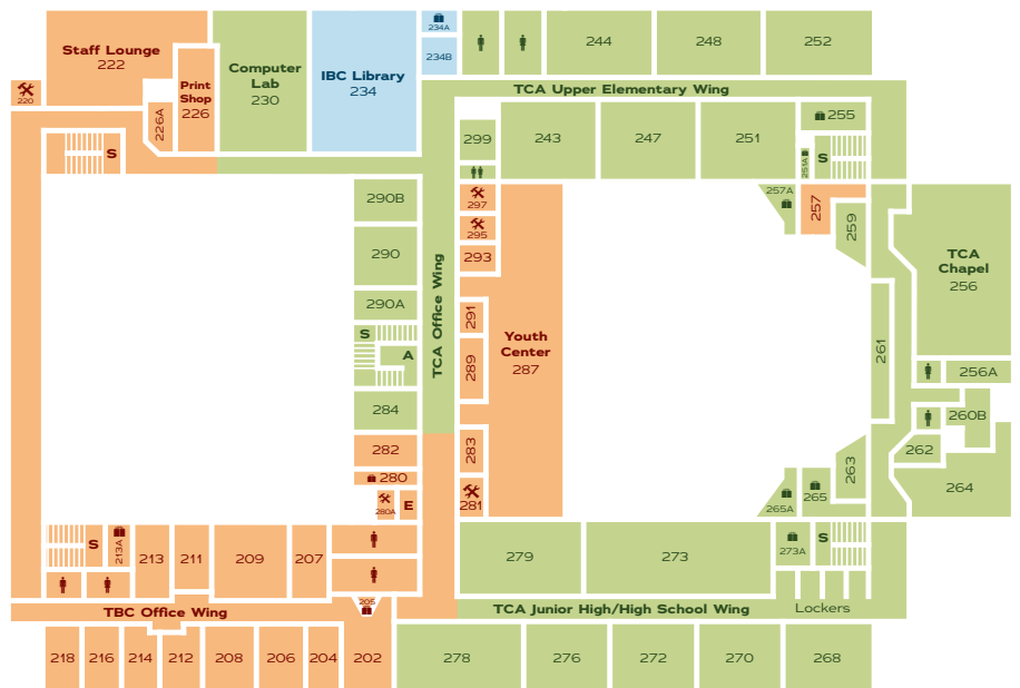
Building A Floor 2